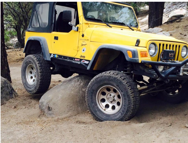
I'd like a 'Frank and Rubicon' on the rocks, cowbell please.