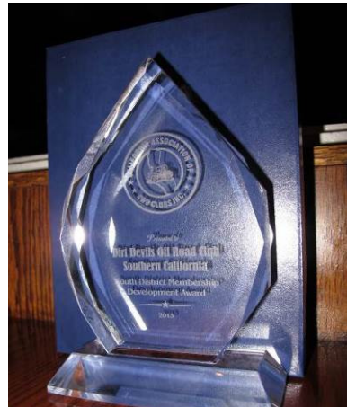
CAL 4 Wheel Drive, new member award